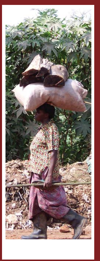
BRONG AHAFO REGION GHANA WEST AFRICA